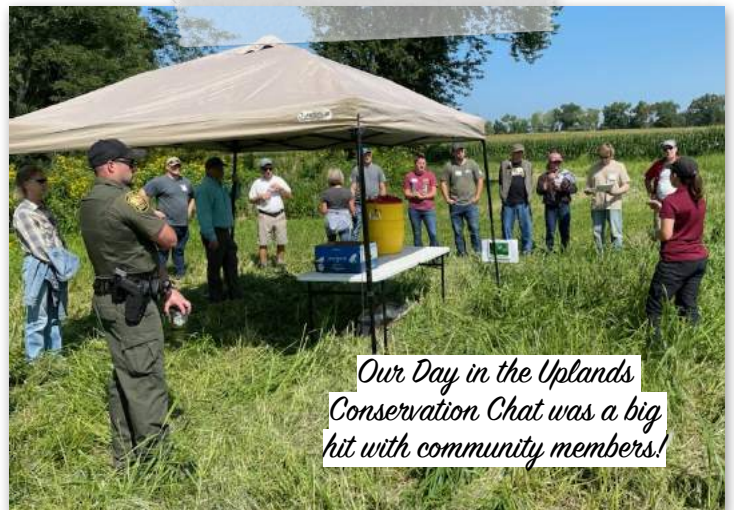
Our Day in the Uplands Conservation Chat was a big hit with community members!