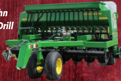
2018 10 ft John Deere No-Till Drill