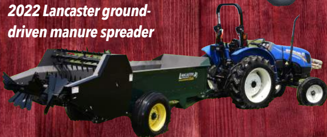
2022 Lancaster ground- driven manure spreader