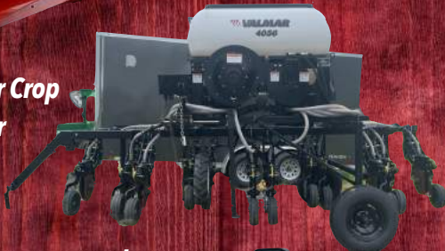
2021 Cover Crop Interseeder