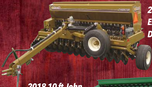
2023 12 ft Esch No-Till Drill

ASHLAND SOIL & WATER CONSERVATION DISTRICT